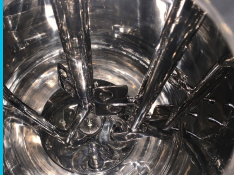
Homogenizing Mixer RW60 Agitator & Homogenizer